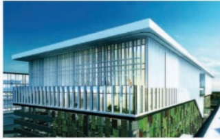
HONG KONG INTERNATIONAL AVIATION ACADEMY HEADQUARTERS (2019/20) 香港國際航空學院總部 (2019/20年落成)