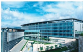
CIVIL AVIATION DEPARTMENT TRAINING FACILITY 民航處培訓設施