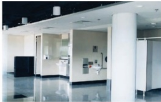
CLEANING TRAINING CENTRE 清潔培訓中心