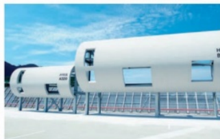
AIRCRAFT FUSELAGES TRAINING FACILITIES 模擬飛機機身培訓設施