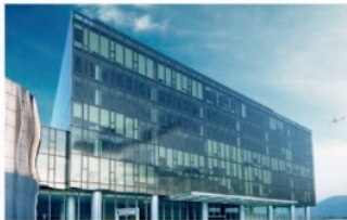
AIRPORT WORLD TRADE CENTRE TRAINING FACILITY 機場世貿中心的培訓設施