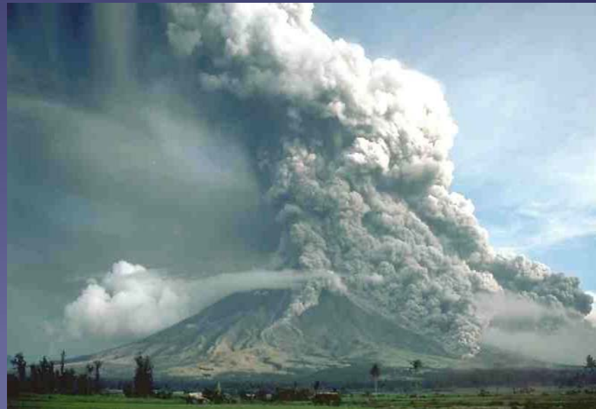
Mayon Volcano on September 23, 1984