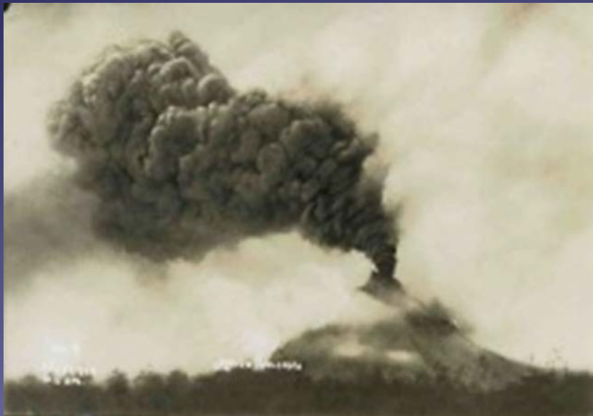
Mount Mayon in eruption on July 21, 1928