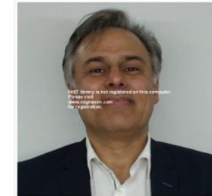
Person 7/27/2018 12:00:00 AM