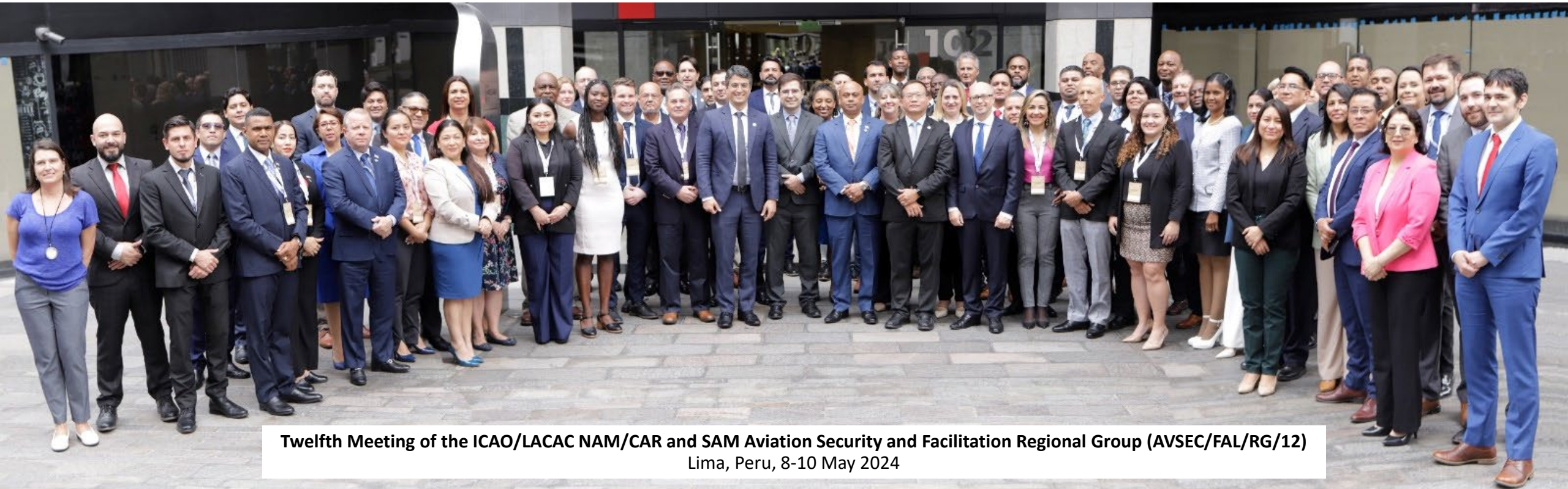
Twelfth Meeting of the ICAO/LACAC NAM/CAR and SAM Aviation Security and Facilitation Regional Group (AVSEC/FAL/RG/12) Lima, Peru, 8-10 May 2024