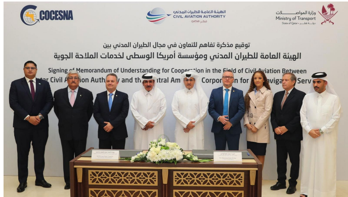
QCAA-COCESNA MoU on Enhancing Civil Aviation Cooperation (2024)