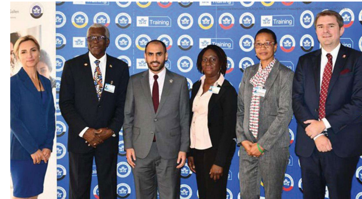
Qatar, IATA, and University of St. Gallen celebrated with the CARICOM Cohort (2022)