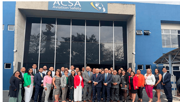
LACAC - QCAA International Criminal Aviation Law course (2024)