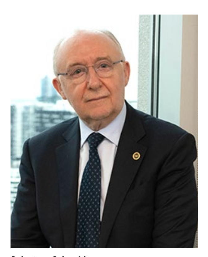
Salvatore Sciacchitano President of the Council

This Strategic Plan reflects the commitment of all ICAO's Member States and its bodies, including the Regional Offices, to work together for a more safe, secure, economically viable, efficient, and environmentally sustainable aviation sector for the benefit of all people, leaving no country behind.