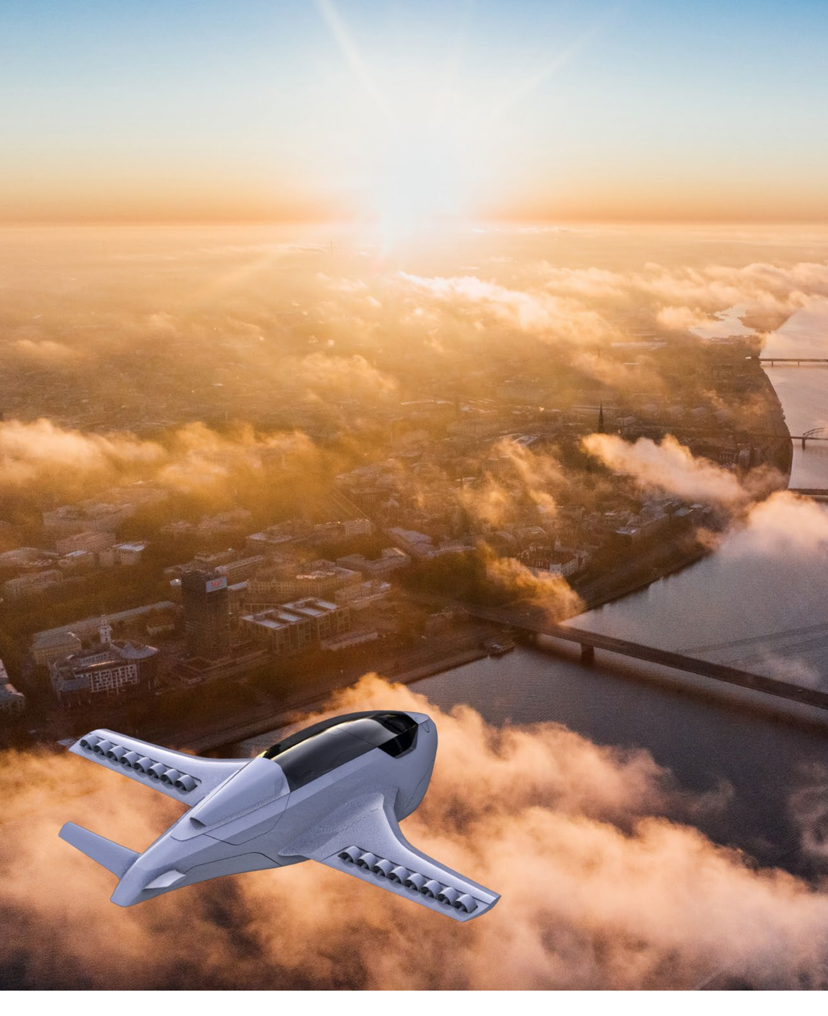
Approved by the Council on 1 November 2024